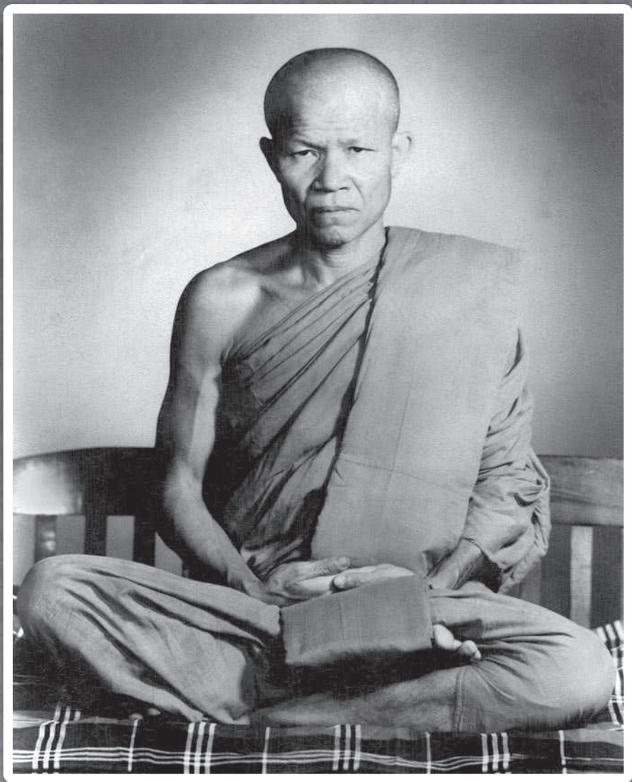
Venerable Ācariya Mahā Boowa Ñāṇasampanno Thera (1913-)